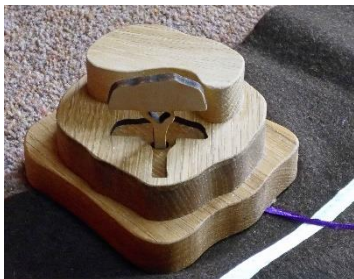
The Mount of Olives

And outside the city walls you need two places: