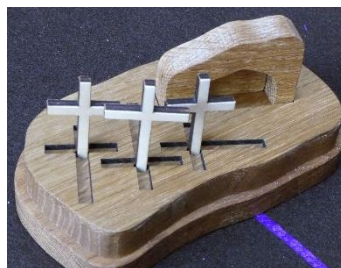
Golgotha, with three crosses