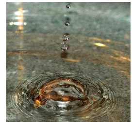
The High Fin Sperm Whale

The Godly Play baptism lesson reminds us of the waters of creation, the dangerous waters of the flood, the water that the people passed through from slavery to freedom, the water that Jesus was baptised in, the water we are baptised in and much more. Each person could take one of these phrases and say it alongside the other thank yous.